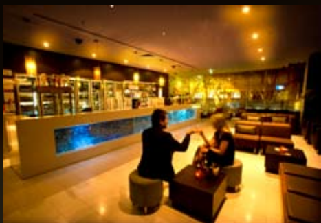
» CQ bar Open 7 days