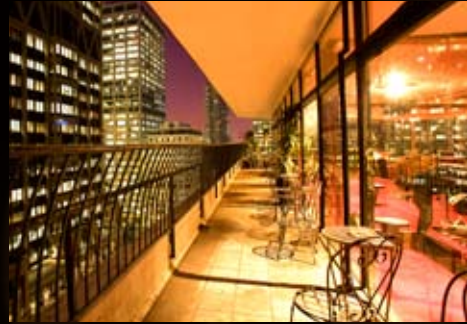
» Blue Diamond Club 5pm to late