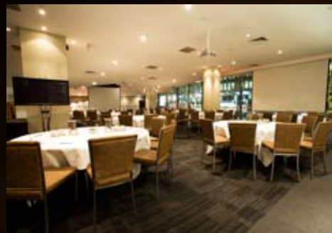
» CQ Functions & Events Rooms