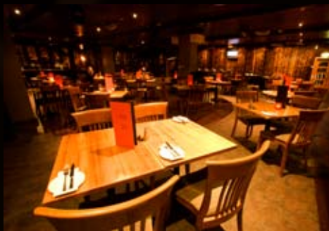
» Lanai Restaurant Open for Lunch & Dinner, Monday - Friday