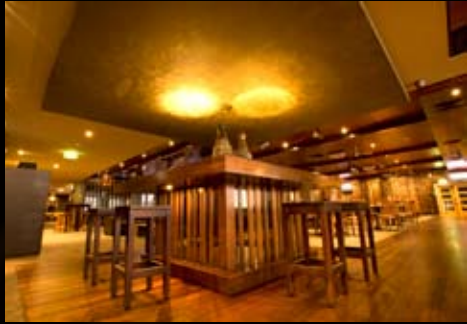
» Lanai Bar Open 6 days, 12noon - late